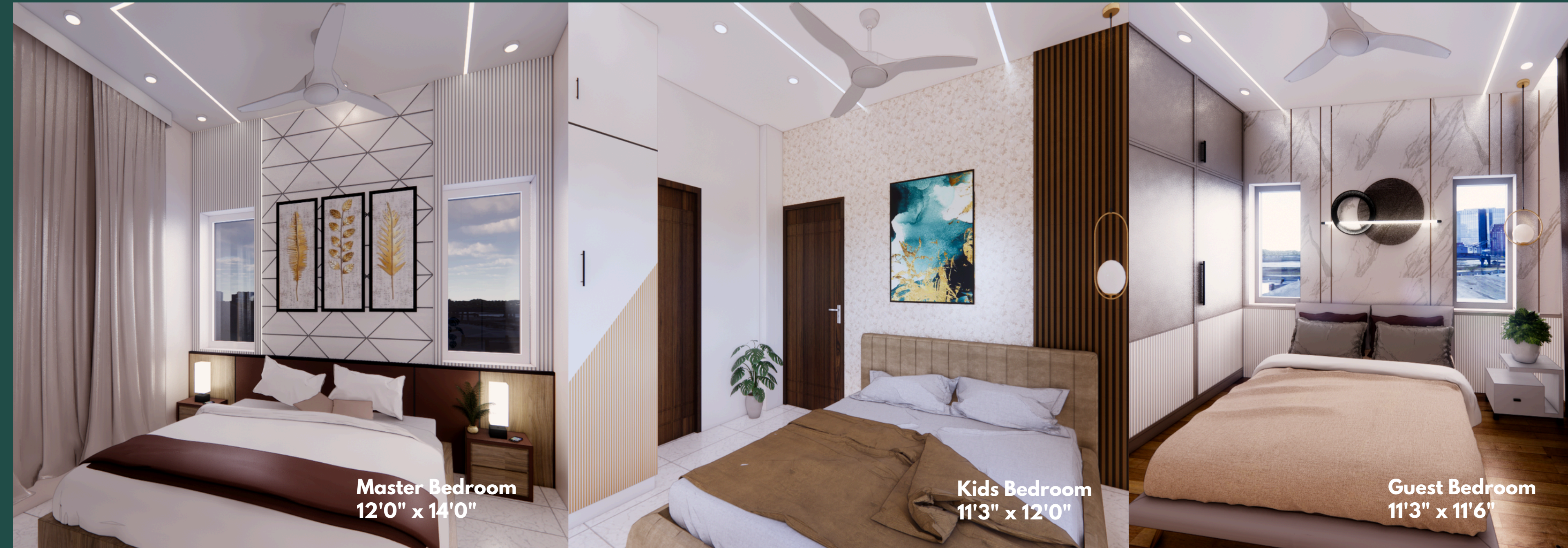
Master Bedroom 12'0" x 14'0"