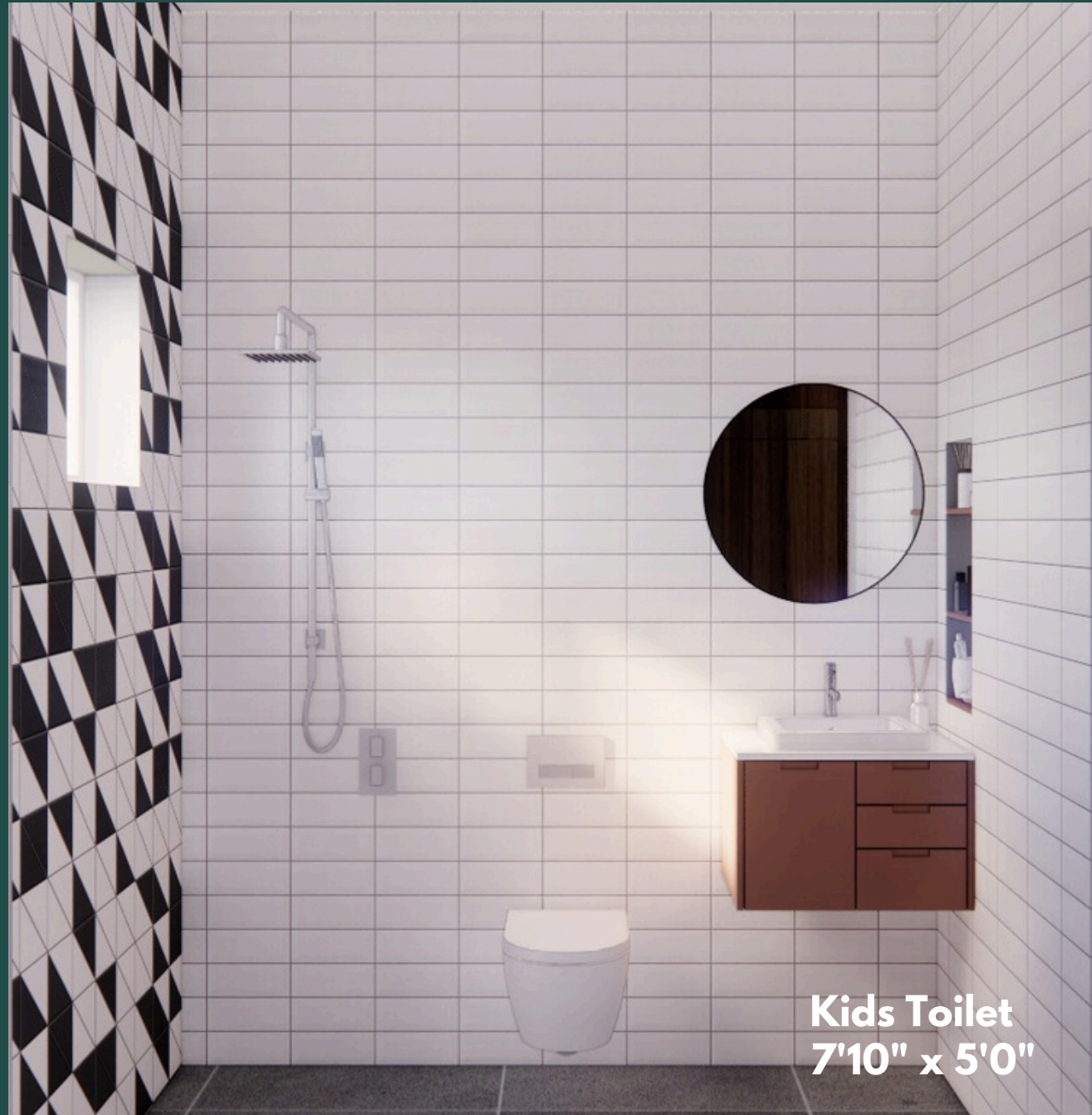
Kids Toilet 7'10" x 5'0"