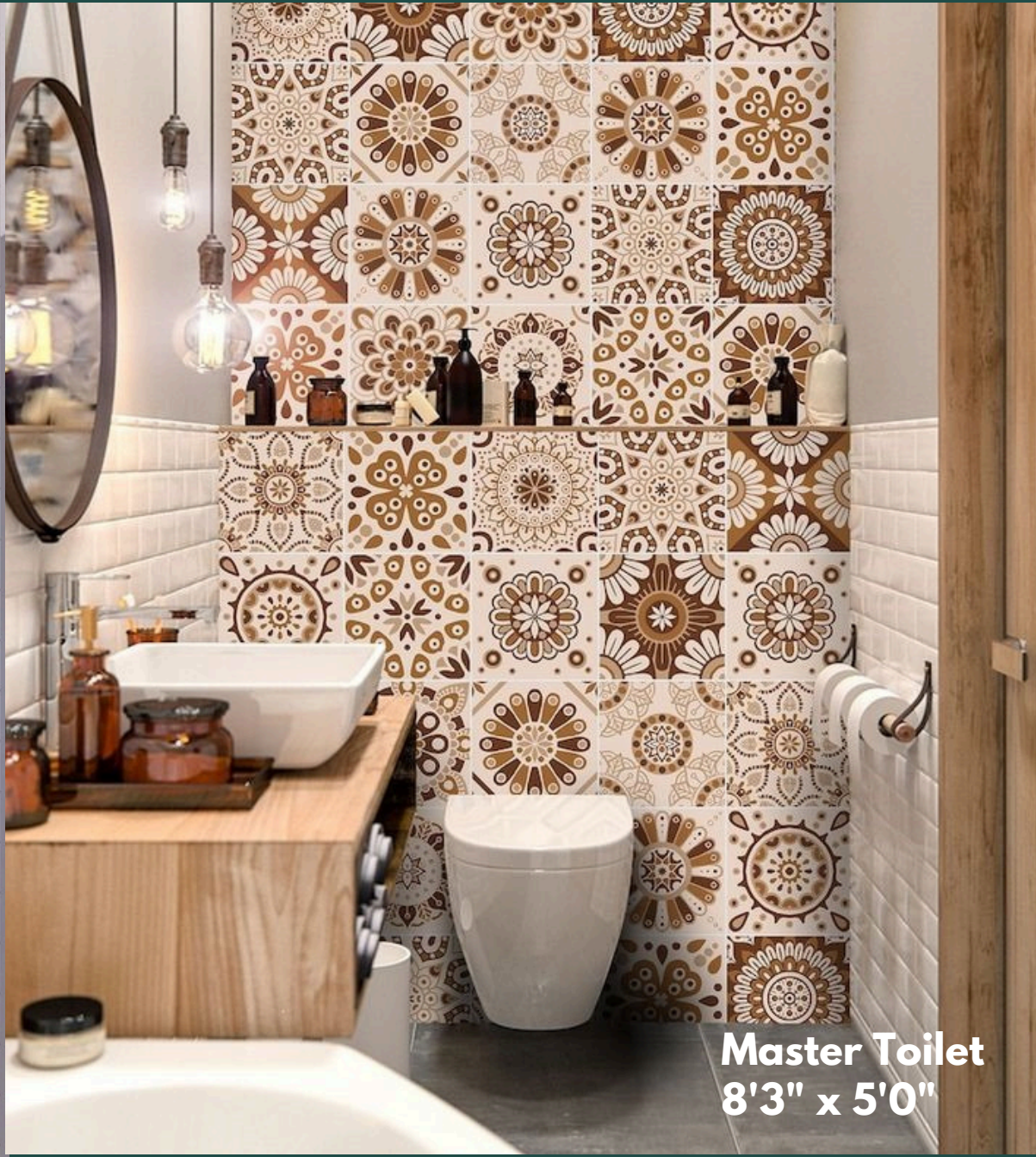
Master Toilet 8'3" x 5'0"