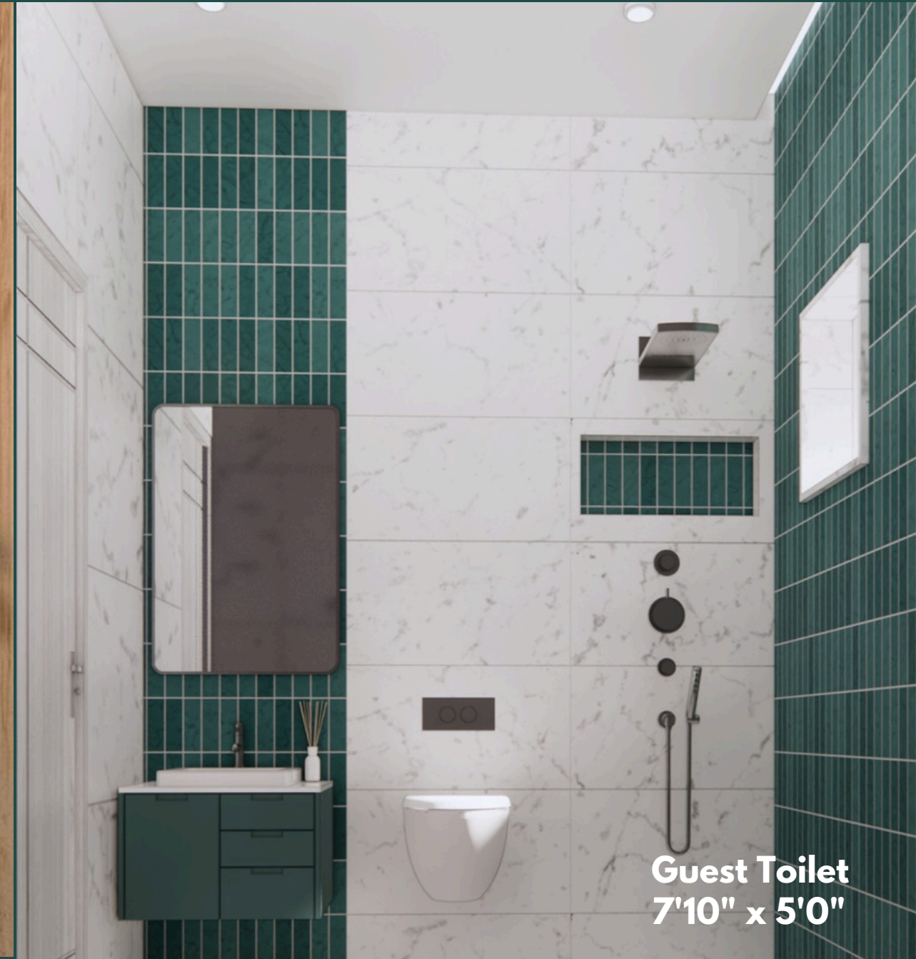
Guest Toilet 7'10" x 5'0"