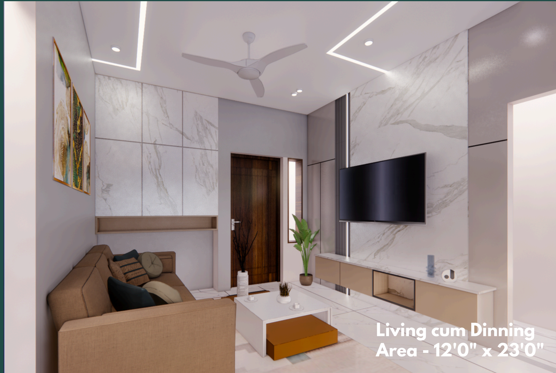
Living cum Dinning Area - 12'0" x 23'0"